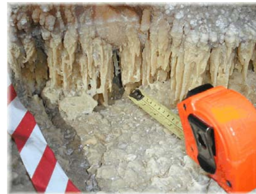
Pool fingers and webulites: lithified remains of fossil microbial cave mats in a paleopool in Carlsbad Cavern, NM.

ambitious mandate: to promote cave and karst science, to further education and public awareness of this unique underground wilderness, to assist those who manage such resources to develop best practices, and to provide a flagship for national and international efforts to enhance speleology and conservation of cave and karst terrain.