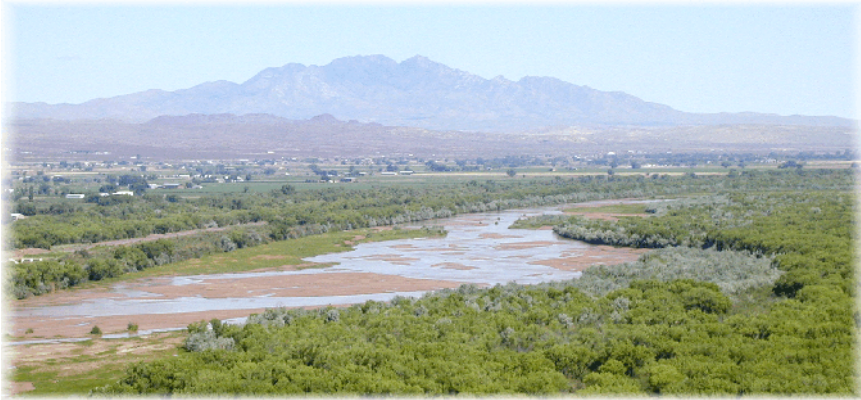
The Rio Grande five miles NE of Socorro.

The Hydrology Program at New Mexico Tech was founded in 1956 by Mahdi Hantush. Hantush and those who later joined him focused primarily on research in groundwater hydrology. For the next forty years, faculty and students here continued to emphasize subsurface hydrology. Somewhat ironically, during this time relatively little research was done related to the Rio Grande, the “lifeblood of New Mexico,” which passes only a few miles east of the campus.