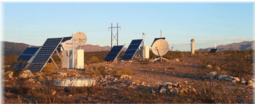
EarthScope prototype seismic stations being tested at New Mexico Tech