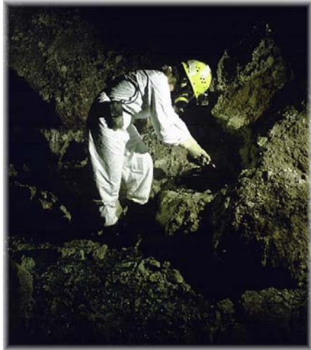
Sampling the high gas emissions at one of the over 25 hydrogen sulfide emitting springs in Cueva de Villa Luz, Tabasco, MX.

the unique minerals and microbiological communities associated with this process. Study sites in a number of ancient New Mexico caves and in modern active sulfur cave systems in Tabasco, Mexico are the primary sites for this study.