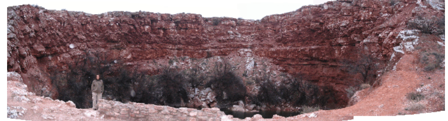
Large subsidence sinkhole lake in gypsum karst terrain at Bottomless Lakes State Park, NM.

CKS, a specialization under both the Geology/Geochemistry and Hydrology Programs, is devoted to cave science in all its many forms. It was instituted in conjunction with the founding of the new National Cave and Karst Research Institute in Carlsbad, NM. Jointly funded by the State of New Mexico and the federal government through the National Park Service, this new institute has an