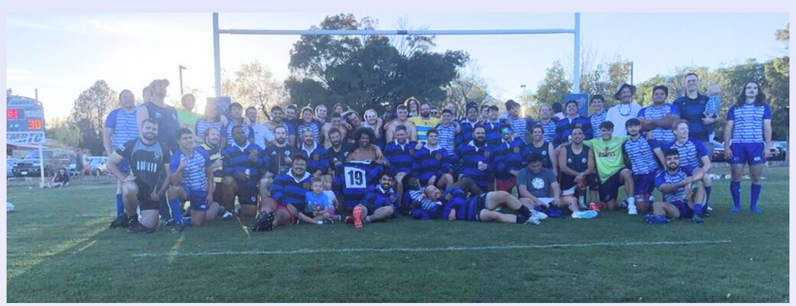
Black and Blue game group photo

New Mexico Tech's umpteenth Annual 49er Black & Blue match on Friday the 13th of October, 2023 ended in a 38-36 victory for the alumni team, reversing a recent string of student victories including 2022's 36-24 score. The result could be seen as a fitting bow by the students to those who helped make New Mexico Tech Rugby what it is after five decades.