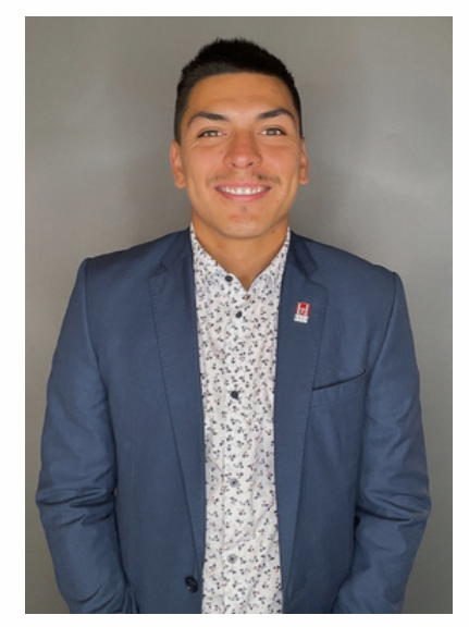
Greetings New Mexico Tech Rugby alumni,

As the Fall 2024 semester kicks-off, it is my great pleasure to announce that an endowment fund for NMT Rugby is officially established. One of my primary goals in the first year of this fund is to reach as many alumni as possible and connect with them in order to receive feedback on ways to strengthen communication amongst all classes of rugby players, both men and women.